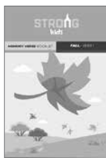
Memory Verse Booklet