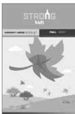
Memory Verse Booklet

The Memory Verse Booklet has this quarter's memory verses for Pre-Primaries and the rest of the age groups. Provide one for each of your students or one per family. You can order the Memory Verse Booklet from RBP.