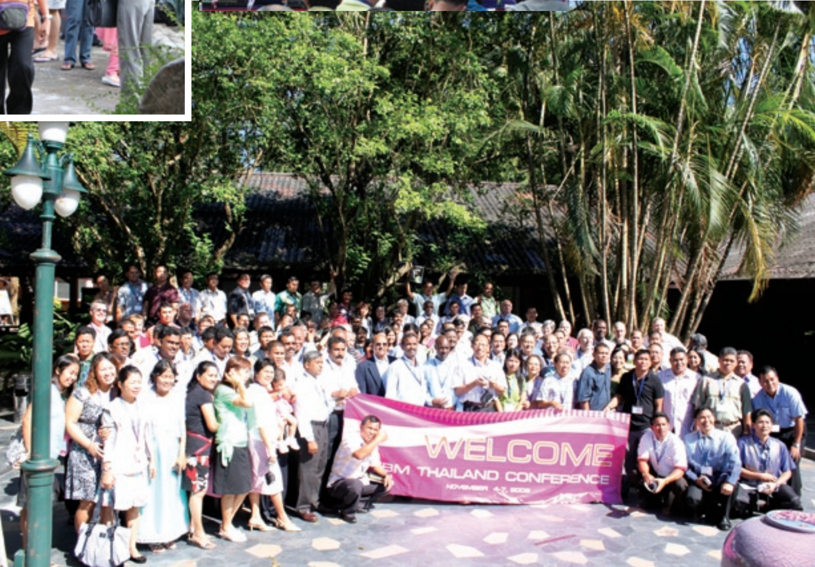
Below: Conferees from 10 countries meet in Bangkok.