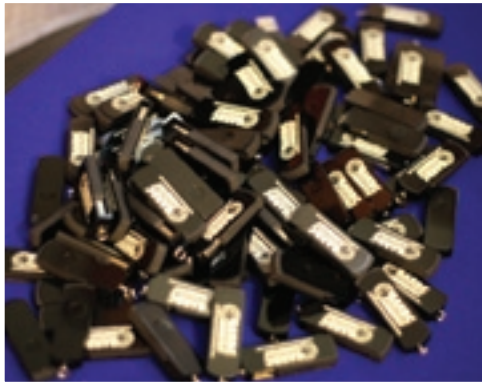
The conferees received USB flash drives full of Bible helps.