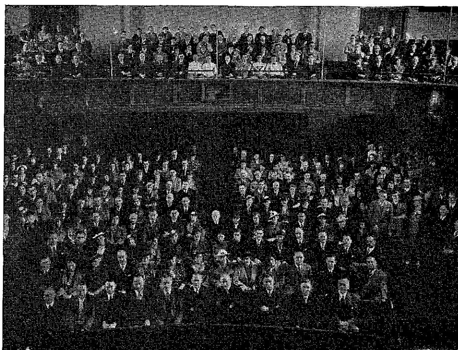
Part of the Wednesday morning crowd at the 5th Annual Fellowship of the General Association of Regular Baptist Churches held at Johnson City, New York, May 10th to 13th, 1937